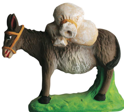
Ane charge de sacs farine Donkey w/ sacks of flour