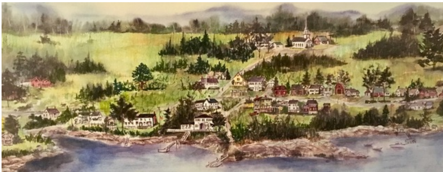
The Village of Day's Ferry the home of Santons de France, USA