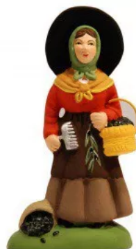
Cueilleuse d'olives (Olive Gatherer) $26.00, $34.00, $38.00