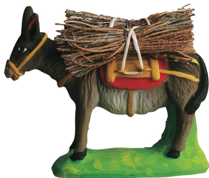
Ane charge fagot Donkey w/sticks

These beautifully crafted donkeys will add great color and excitement to your collection.