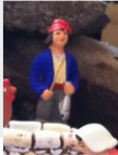
Pêcheur Au Filet (Man with fishing pole)