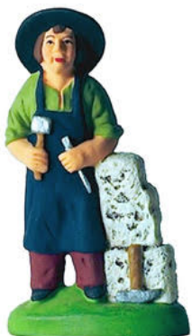
Tailleur de Pierre (Stone Cutter) $34.00