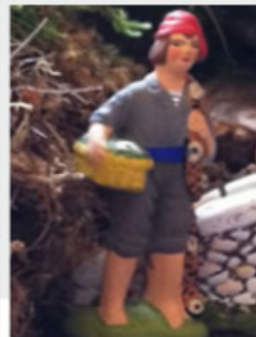
Pêcheur A La Linge (Man with Net)