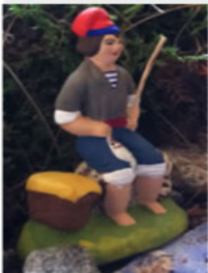
Pêcheur Assis (Seated Young Boy Fishing)