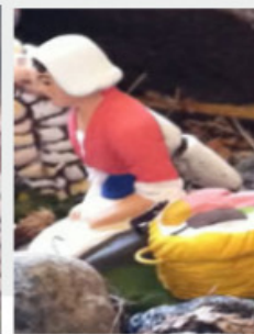
(Laveuse) Kneeling Washer Woman)