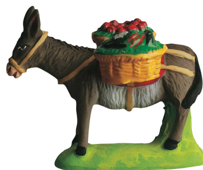
Ane charge fruits Donkey w/fruit