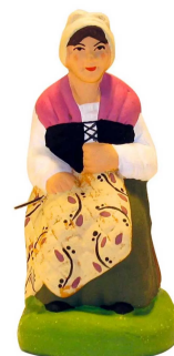
Femme au Boutis (Quilter) $18.00, $27.00, $34.00