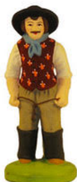
Sourcier (Water Douser) $27.00